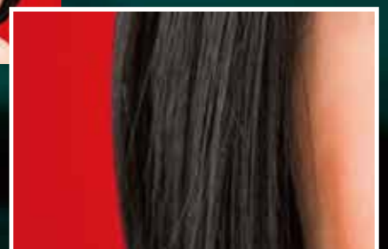
Enlarged image of high density area

The WX inks achieve high-density colors and details in dark areas. The M-64s meets customers' needs for sharp, clear and bright backlit signs.